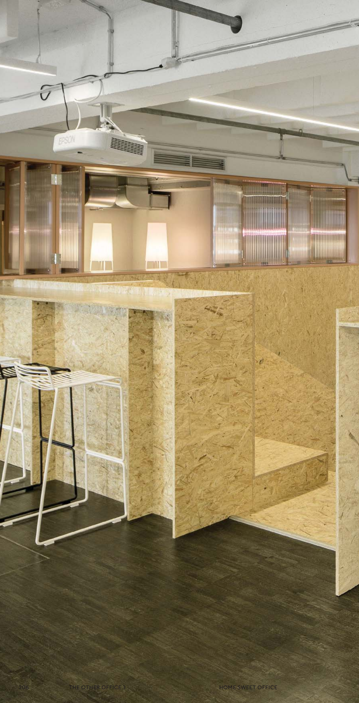
The communal kitchen on the upper floor features a large, freestanding counter, inviting communication between staff as they enjoy their food.